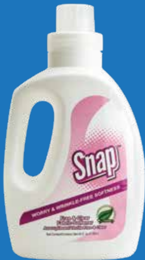
Snap® Free & Clear Fabric Softener Code: 76229

Snap Free & Clear products make the hassle of laundry easier by providing an Eco-Friendly, Hypoallergenic detergent that can do up to 80 loads of laundry, saving you time and money!