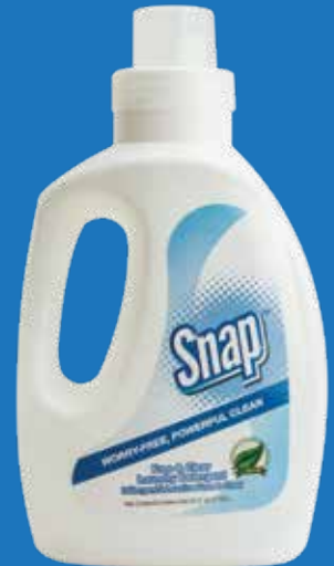
Snap® Free & Clear Laundry Detergent Code: 76228

Snap Free & Clear products make the hassle of laundry easier by providing an Eco-Friendly, Hypoallergenic detergent that can do up to 80 loads of laundry, saving you time and money!